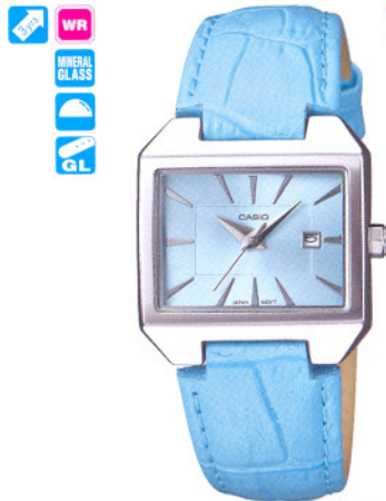
LTP-1333L-2ADF 3363 © Ion plated