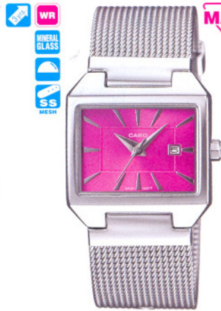
LTP-1333BD-4ADF 3363 © Ion plated