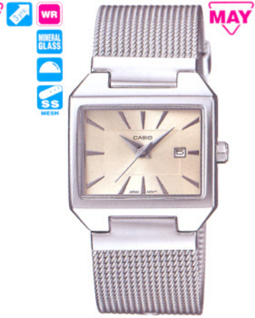
LTP-1333BD-9ADF 3363 © Ion plated