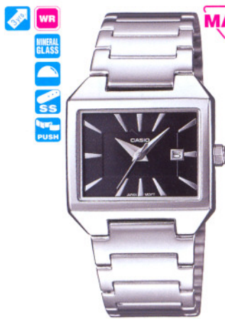
LTP-1333D-1ADF 3363 © Ion plated