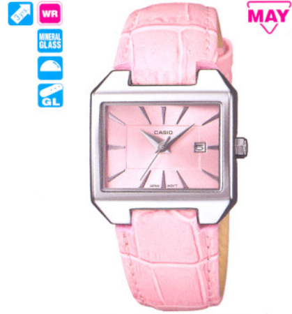
LTP-1333L-4ADF 3363 © Ion plated