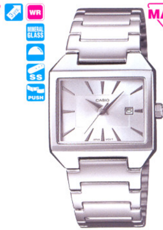
LTP-1333D-7ADF 3363 © Ion plated